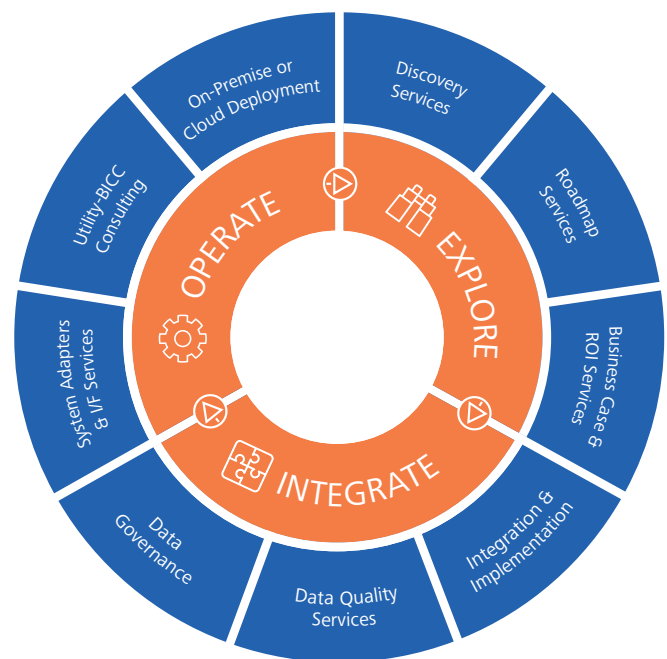
Figure 1: OMNETRIC Group's Energy Insight services

The OMNETRIC Group Smart Grid Data Discovery approach is a rapid-deployment solution that includes the skilled input of our data scientists but requires no up-front data integration effort. It lets utilities interrogate and explore unknowns, delivering insight faster. Data discovery can make use of almost any available data to find correlations, provide quick answers, indicate trends and probabilities, uncover dormant potential, and enable utilities to ask new questions – questions they didn’t know to ask.